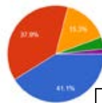
Which best describes your attitude toward returning to a worship service at Pathway? 124 responses

Pathway recently indicated through a church-wide survey that many are ready to come back as soon as possible, but they plan to do so with precautions. For that reason, we will require (for the immediate future) that all wear facemasks and require physical distancing (refrain from handshakes, hugs, etc.). In worship services, families will sit together, but family groups will distance themselves from other family groups. In addition, the reset team is making plans to ensure the disinfection of worship and meeting spaces prior to each gathering.